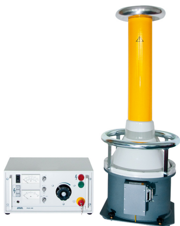
The figure is illustrative.